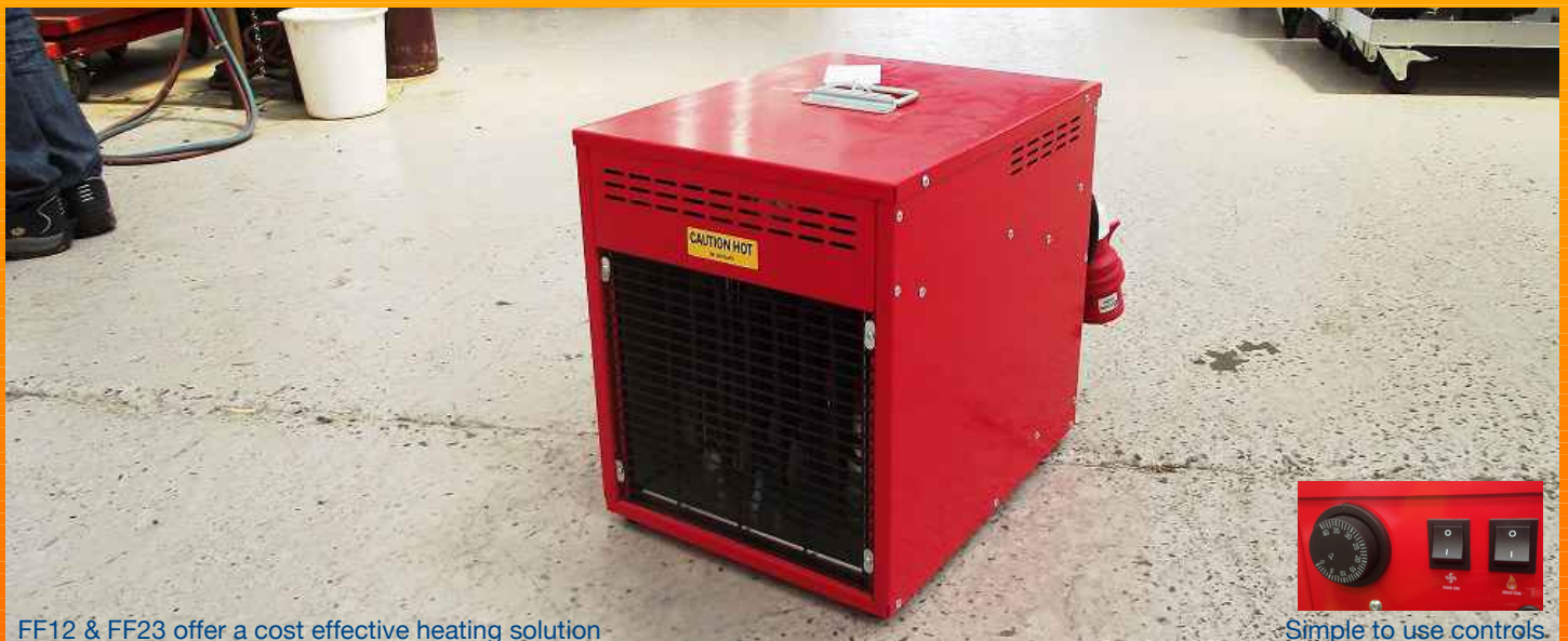
FF12 & FF23 offer a cost effective heating solution