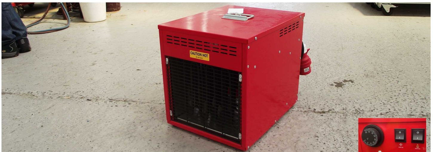
FF12 & FF23 offer a cost effective heating solution