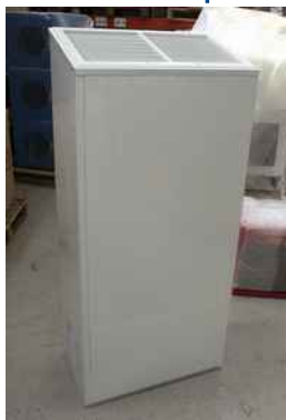
Tamper proof controls at rear of machine