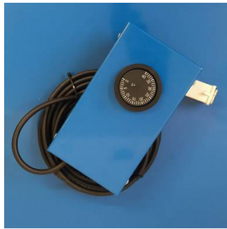
Remote thermostat supplied as standard