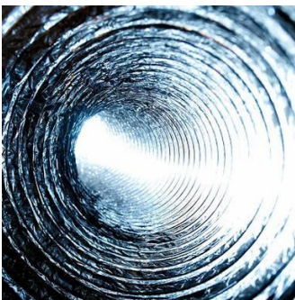
10m insulated duct available