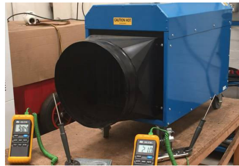
Thermostatic probes demonstrating the impressive temperature rise