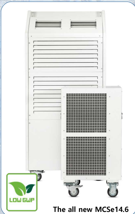
The all new MCS e 14.6