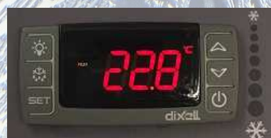
Digital thermostat allows for simple yet effective operation

The MCS e range uses R454C, a low GWP (Global Warming Potential) refrigerant that's 95% less harmful to the environment than some traditional refrigerants. Not only that, but as it's A2L rated neither does it have the flammability issues associated with other low GWP refrigerants such as R290 (Propane) either.