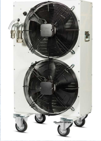
Powerful heat exchanger