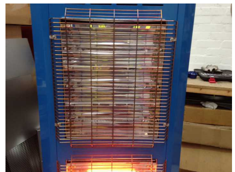
Half and full heat settings