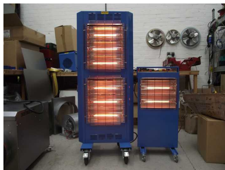
New RG9 compared to the RG308