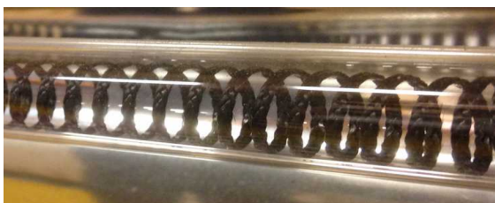
New carbon fibre filaments offers unrivalled strength and heat efficiency compared to standard bulbs