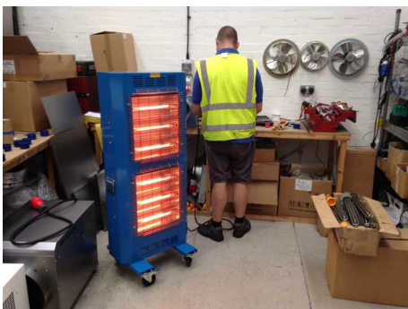
Ideal for warehouse & industrial applications