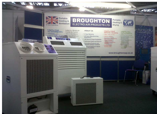
Broughton at the ACR Show 2014

Customer Order Line 01527 830610 Technical Advice 01527 830616 E: sales@broughtoneap.co.uk F: 01527 527558