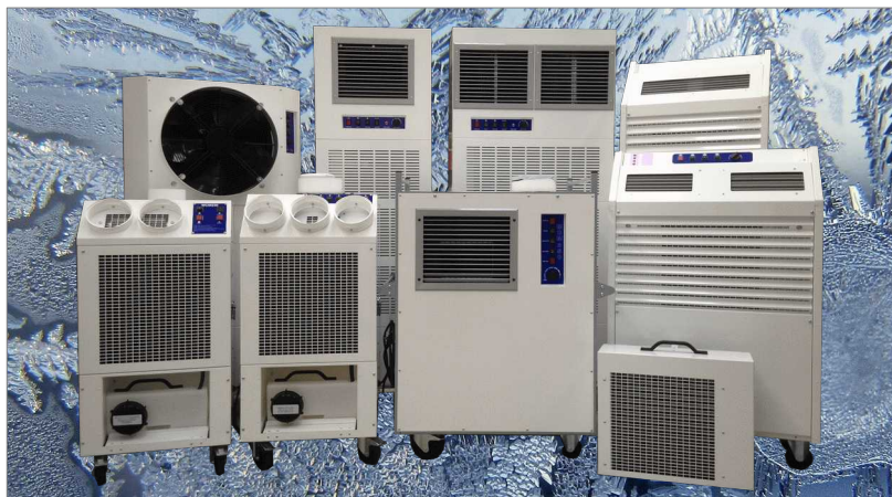
Full range of Broughton Cooling Equipment