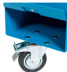
Forklift skids and lifting eyelets