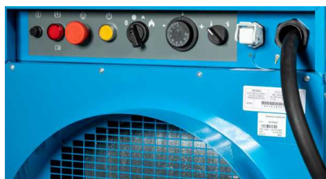
Easy to use controls with built in safety features as standard