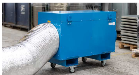
Ductable to 20m in conjunction with a 500mm aluminium duct