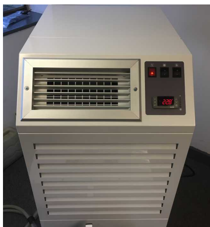
Easy to use controls