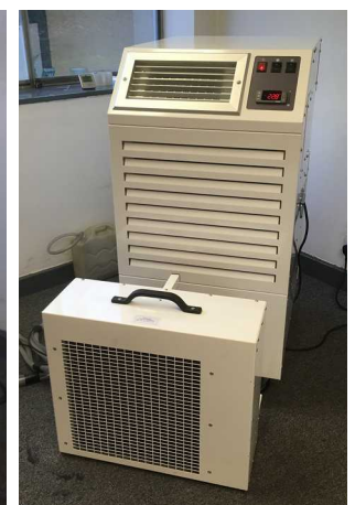
Industrial build quality

As Broughton strive to manufacture to the highest standards specifications and performances are subject to change without notice.