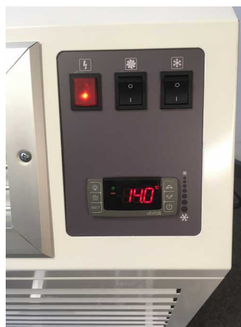
The digital display indicates both the required and ambient room temperature