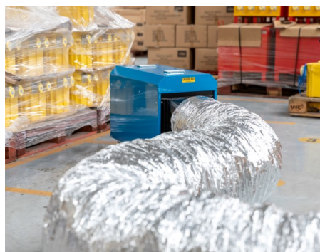
10m x 300mm diameter insulated duct available