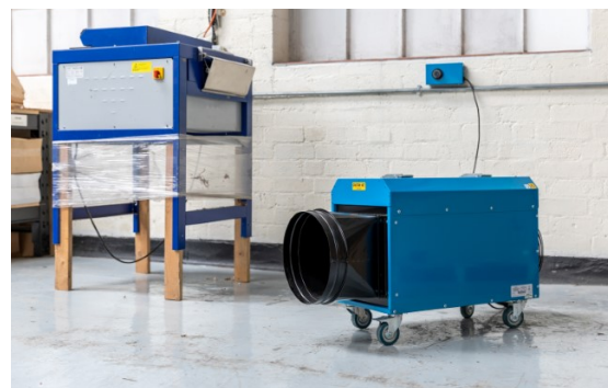
Remote thermostat allows for flexible operation

Customer Order Line 01527 830610 Technical Advice 01527 395635 E: sales@broughtoneap.co.uk F: 01527 527558