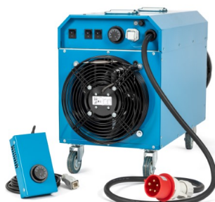
Remote thermostat supplied as standard