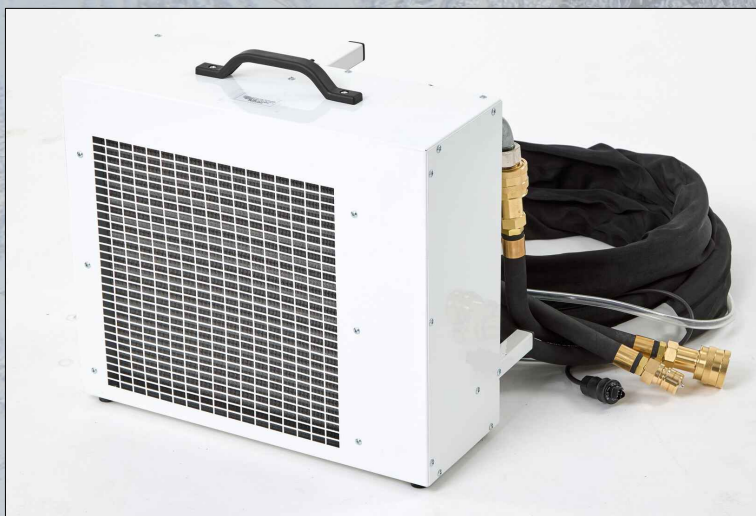
The all new Broughton umbilical lines