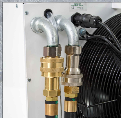
Easy push fit connections