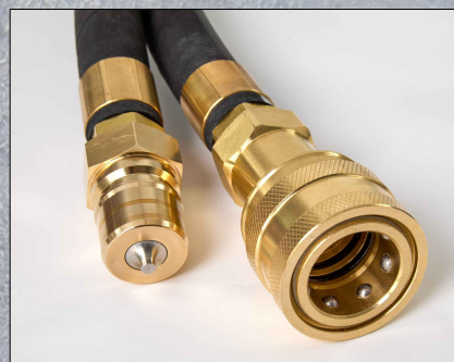
High quality quick release couplings