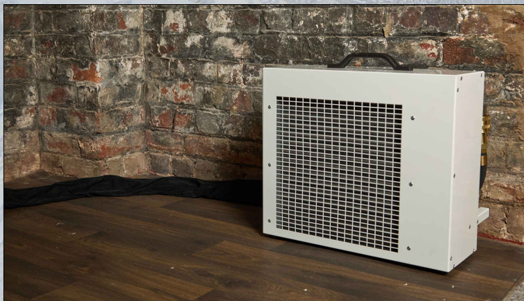
Designed to withstand the rigours of commercial applications