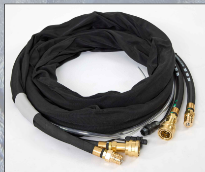
Available in 5M, 10M and 30M lengths

Call us on 01527 830610 or visit www.broughtoneap.co.uk