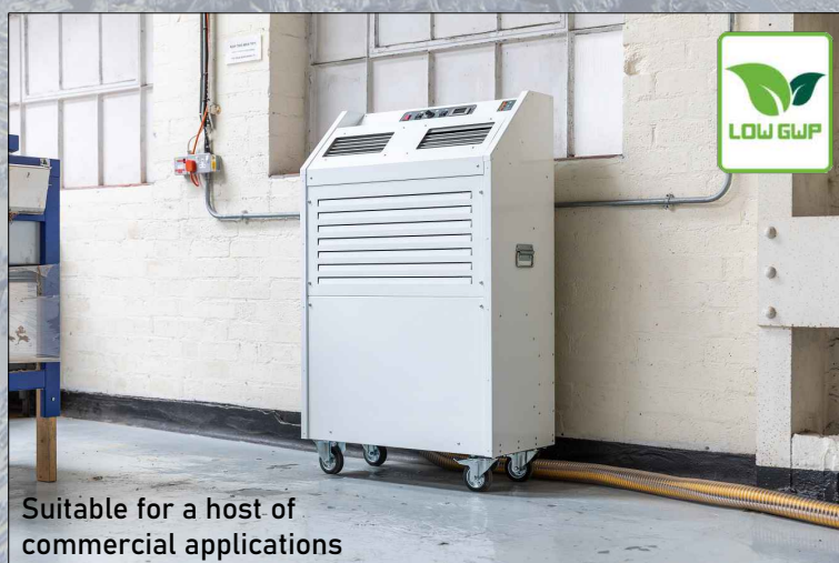
Suitable for a host of commercial applications