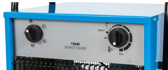
Easy to use controls and manual temp protection

Customer Order Line 01527 830610 Technical Advice 01527 395635 E: sales@broughtoneap.co.uk F: 01527 527558