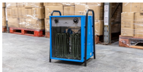
Ideal for warehouse applications