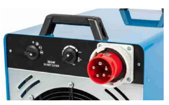
Fan Only/20kW/30kW Settings

The IFH30 also features built in thermal protection and is supplied with two year warranty.