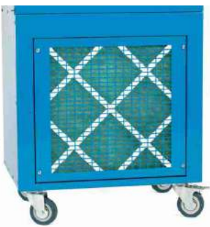
Air intake filter as standard