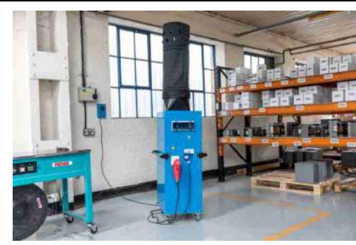
The Ideal solution for all warehouse and workshop applications

Customer Order Line 01527 830610 Technical Advice 01527 395635