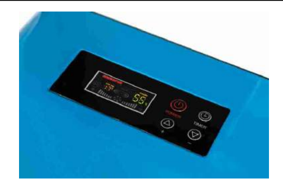
Easy to use touch screen controls