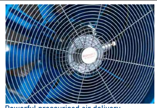
Powerful pressurised air delivery