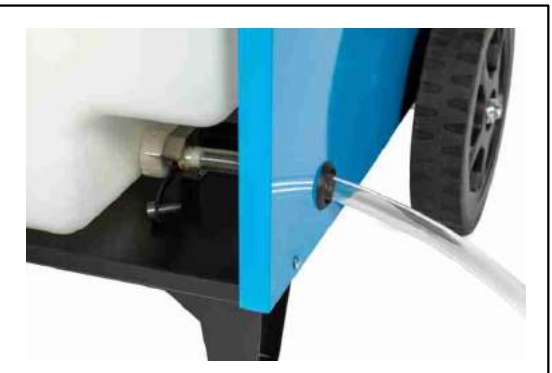
7L condensate tank with condensate hose

Customer Order Line 01527 830610 Technical Advice 01527 395635