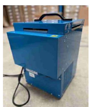
Tough industrial design

Customer Order Line 01527 830610 Technical Advice 01527 395635 E: sales@broughtoneap.co.uk