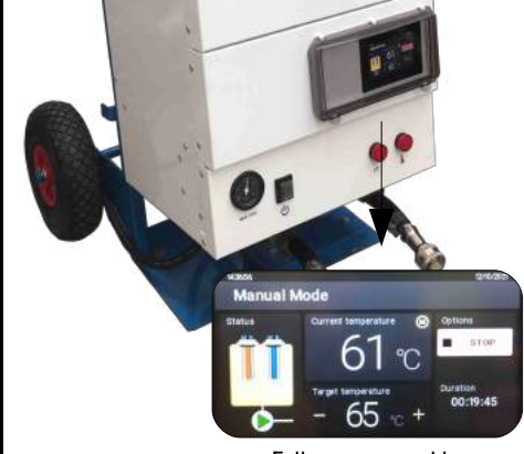
Fully programmable digital controller