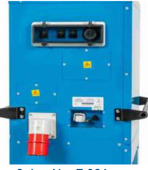
3ph + N + E 32A appliance & remote thermostat inlet