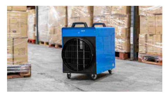
Ideal for warehouse applications