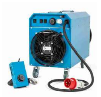
Remote thermostat supplied as standard