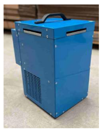
The all new FFVH10

Available in standard 230V the FFVH10 is ideally suited to applications up to 80 square meters.