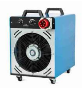
High volume airflow

Customer Order Line 01527 830610 Technical Advice 01527 395635