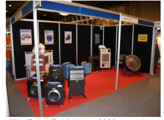
Broughton MCM27, MCM20 & Cool Home Spec Sheets