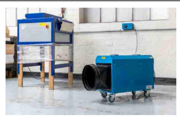
Remote thermostat allows for flexible operation

Customer Order Line 01527 830610 Technical Advice 01527 395635 E: sales@broughtoneap.co.uk