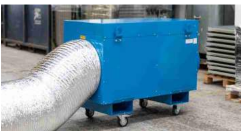
Ductable to 20m in conjunction with a 500mm aluminium duct