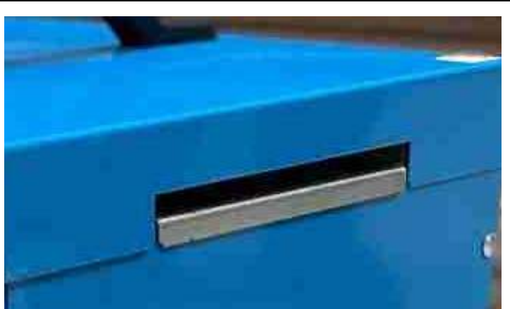
360° heat distribution