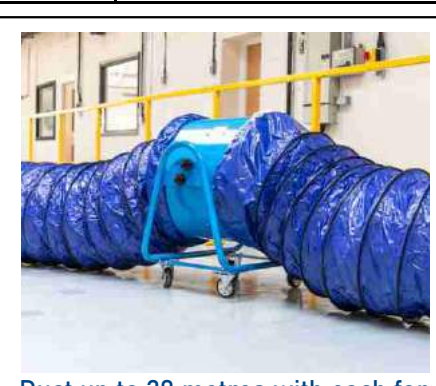
Duct up to 20 metres with each fan

Customer Order Line 01527 830610 Technical Advice 01527 395635 E: sales@broughtoneap.co.uk