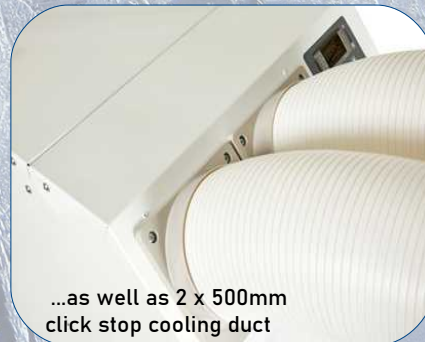
...as well as 2 x 500mm click stop cooling duct