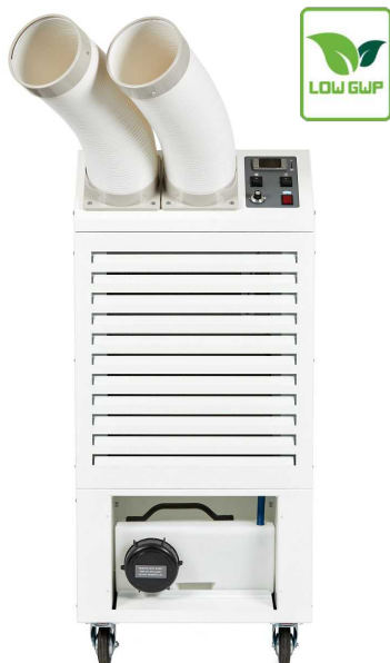
The all new MCe7.3

In addition to the environmental credentials the MCe7.3 delivers unrivalled performance by offering nearly 8kW of cooling from a standard 13A supply and the ability to exhaust the warm air over 10m through lightweight standard 300mm ducting. Also featuring fully adjustable airflow, digital thermostatic control, auto shut off and indicator light to show the condensate tank is full and lockable castors for easy manoeuvrability, the MCe7.3 is probably the most versatile portable air conditioner on the market.