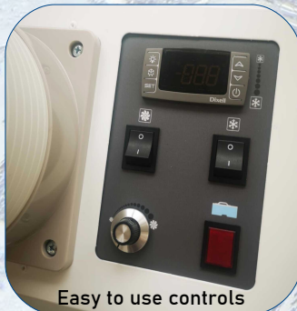
Easy to use controls