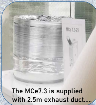
The MCe7.3 is supplied with 2.5m exhaust duct.....